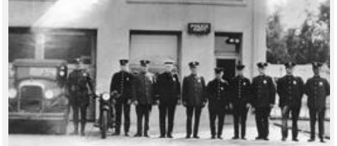
Early Police Department

How well do you know our city? Take this quiz to find out: